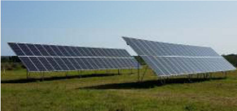
Detroit Lakes Public Utility's 29.3 kW Select Solar Community Solar Garden Detroit Lakes, MN